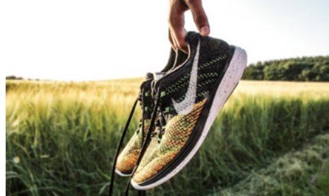
MANAGEMENT MATTERS NETWORK: How Activating A Corporate Brand Kickstarts Radical Innovation