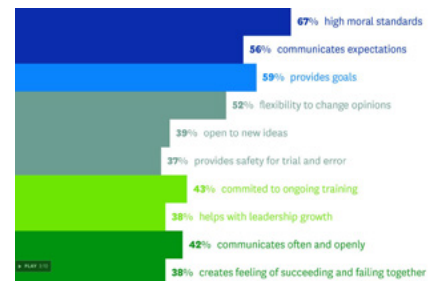
HARVARD BUSINESS REVIEW: Solution to Top 5 Leadership Challenges