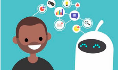
DIALOGUE: The AI Rules of Leadership