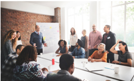
INC.: 10 Secret Communication Skills of the Best Leaders