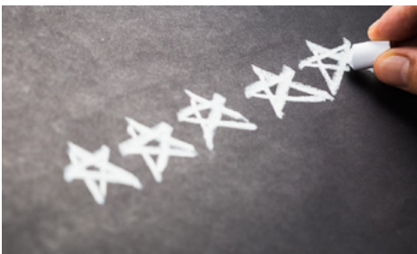
FORBES: Turning Performance Reviews Into A Vehicle For Radical Innovation