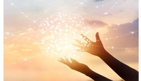
FORBES: Essential Skills To Keep Your Job In The Era Of Artificial Intelligence