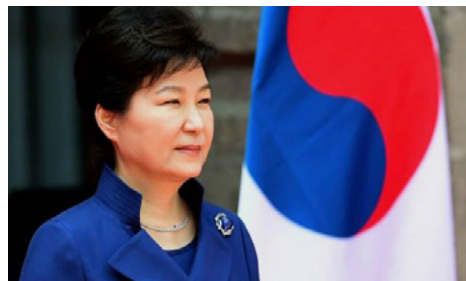
THE KOREA TIMES: Leadership Crisis In Korea